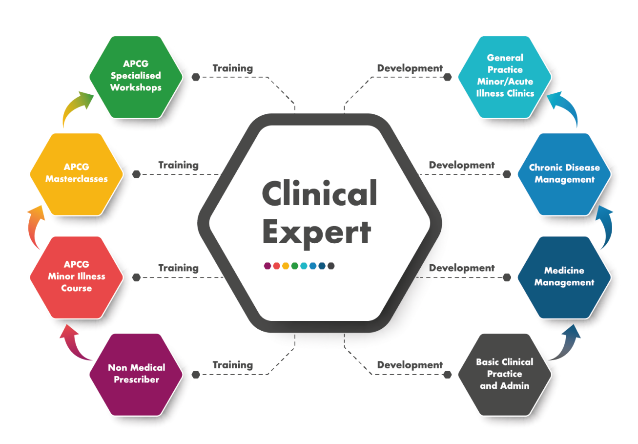
APCG- Training and Development Bridge

Whether you are looking for long term or short term support, we have the solution for you.